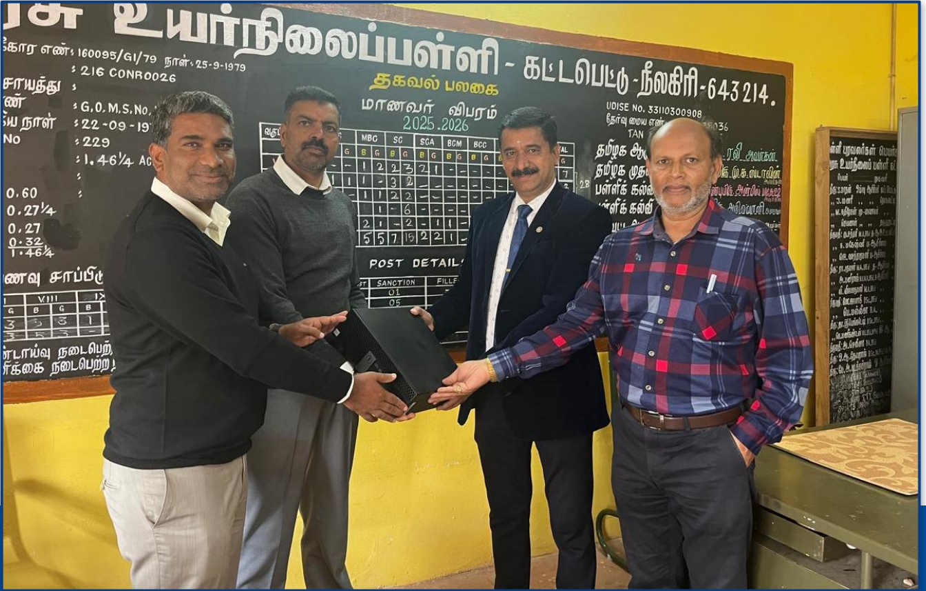
A CPU was donated to Government High School, Kattabetu

The FOUR way test of the things we think, say, & do