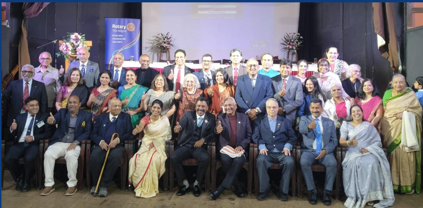
The Rotary family of the RC Nilgiris celebrating Charter Day and the GOV