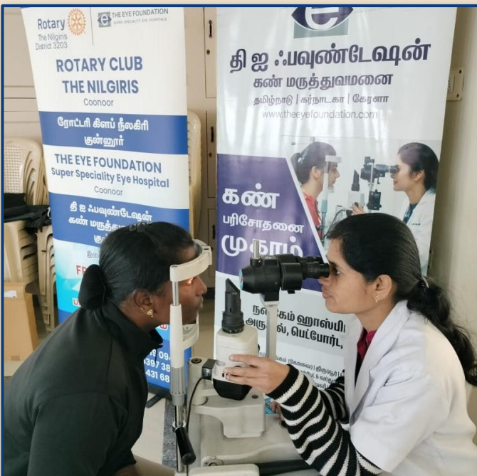
Police & Public Coonoor