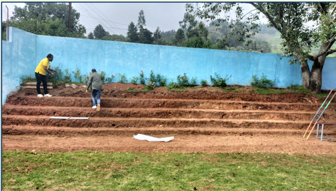
A mini amphitheatre style seating area for outdoor events is coming up in the school grounds. This is a generous contribution from Rtn. Raunak Jain