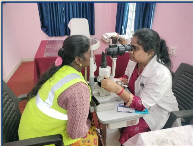
Sim's park & Horticulture Office Staff